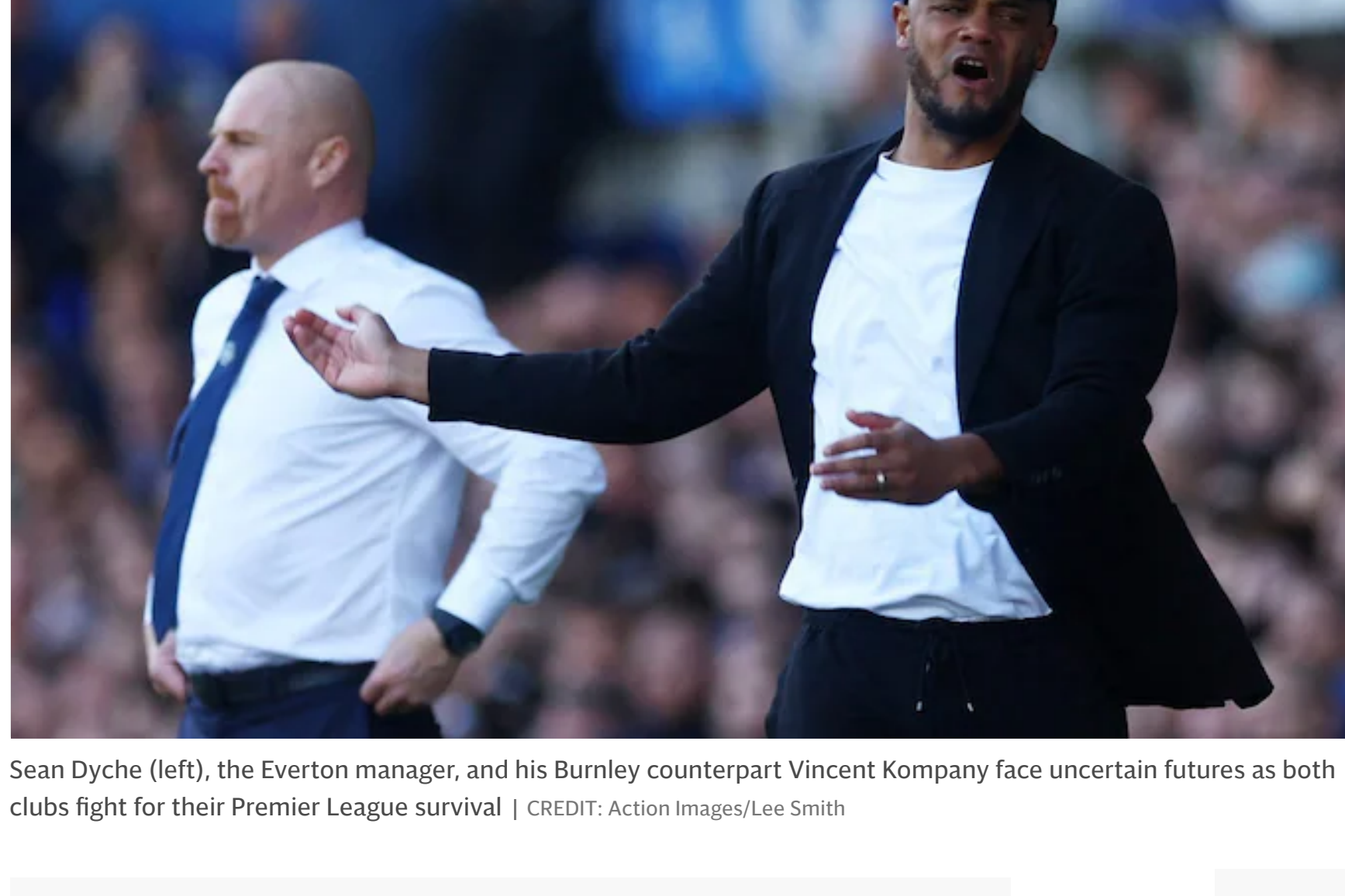
Sean Dyche (left), the Everton manager, and his Burnley counterpart Vincent Kompany face uncertain futures as both clubs fight for their Premier League survival